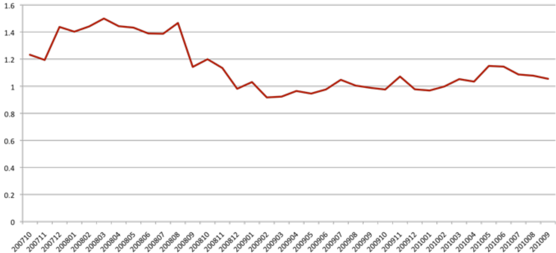
Allocation / Assignment (Annual)